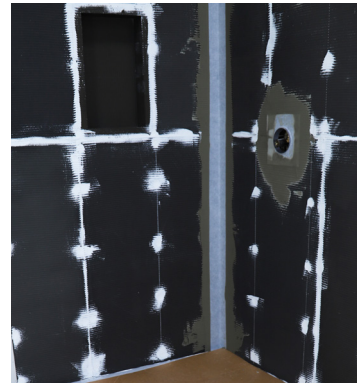
Method 2 (ARDEX CA 20 P™)