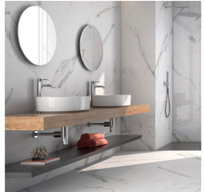
Bianco Venatino Unpolished 35"x35" R

Bianco Venatino, a timeless masterpiece. The majestic elegance of marble, with its dark and strong veins, creates a dramatic and luxurious feeling in any project.