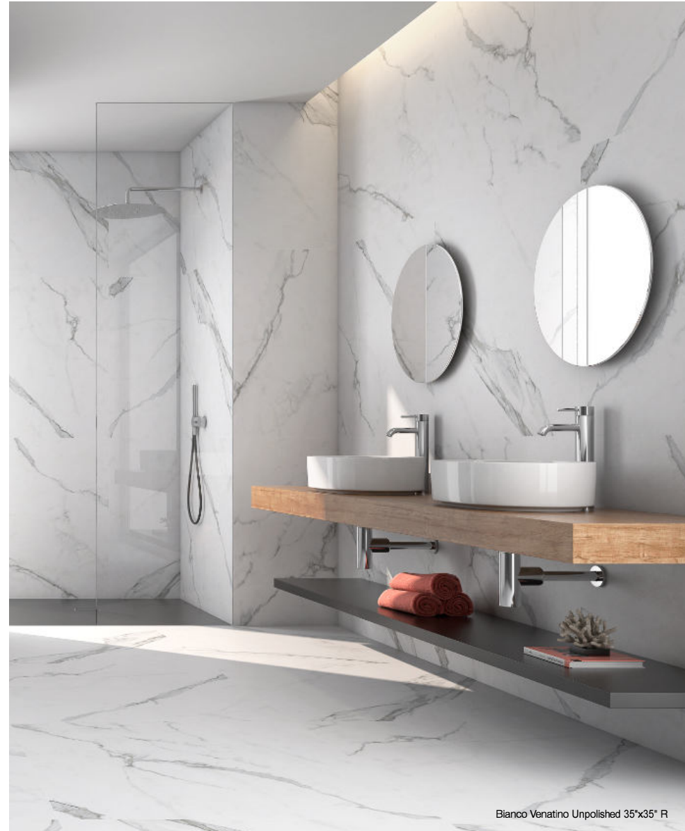
Bianco Venatino Unpolished 35"x35" R