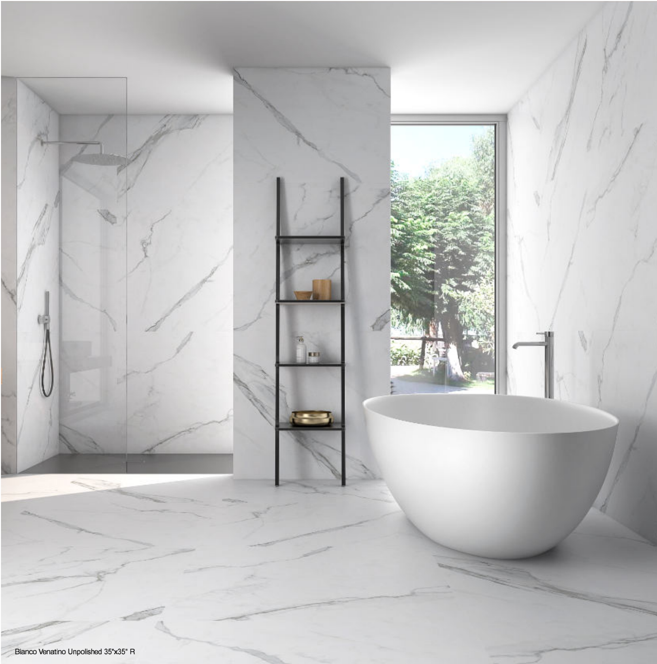
Bianco Venatino Unpolished 35"x35" R